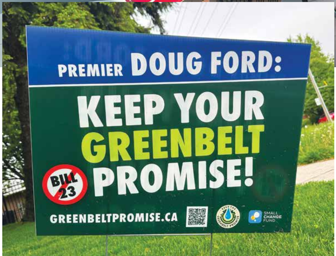
► Spotted in Ancaster.