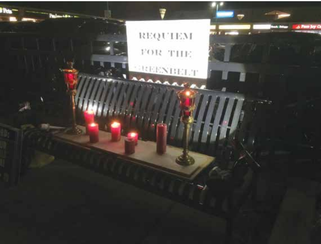
▲ In mid-December 2022, members of Biodiversity and Climate Action Niagara held a Requiem for the Greenbelt candlelight vigil along King Street in Beamsville.

“The Conservative government doesn’t care about protests in Liberal or NDP ridings, but they do care about what happens in ridings they hold.”