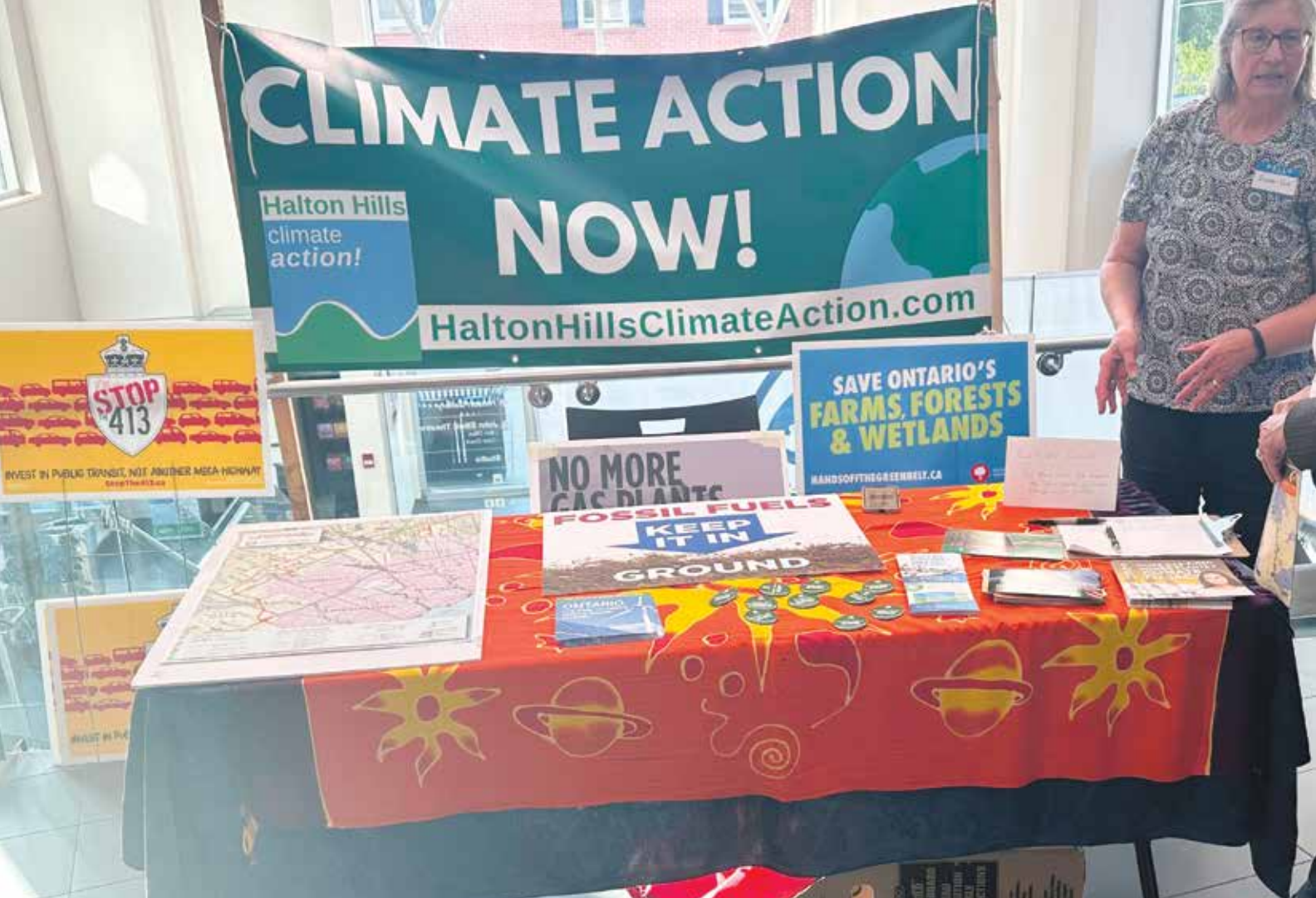
▲ Halton Hills Climate Action is just one community group with concerns about the Greenbelt, including stopping sprawl and saving farmland.