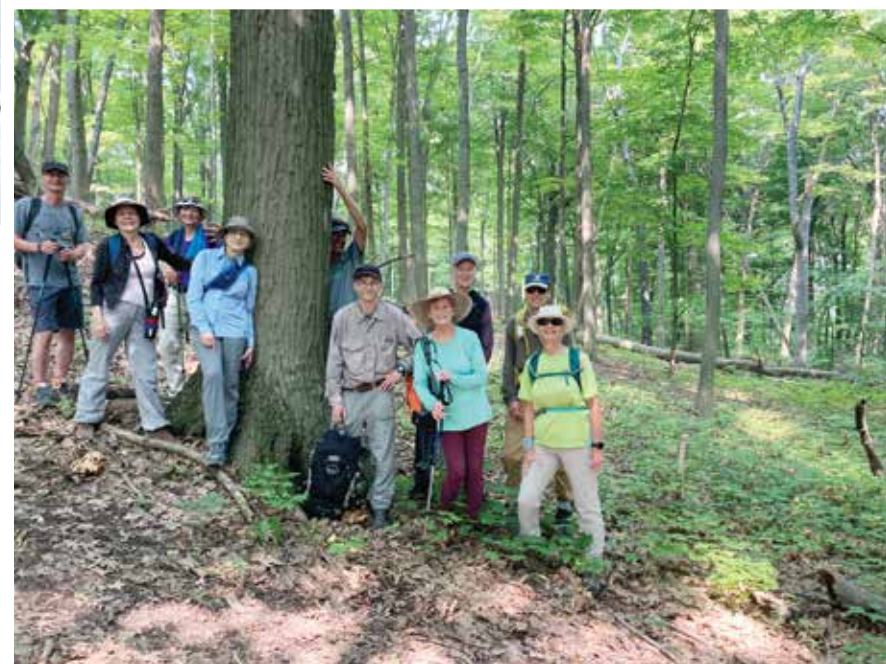
▲ Tuesday morning hikes on the Niagara section of the Bruce Trail.