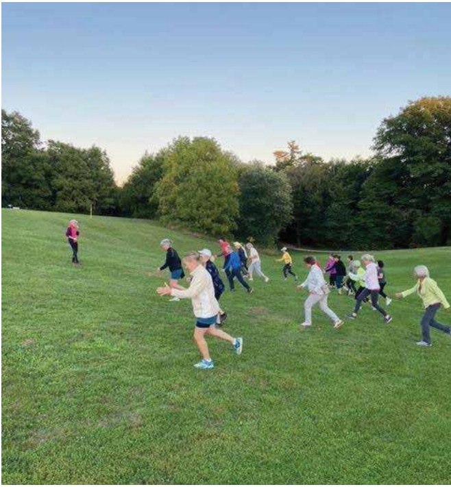
▲ Club members prepare for the winter sport season with “Winterfit” classes, La Salle Park, Burlington, 2022.