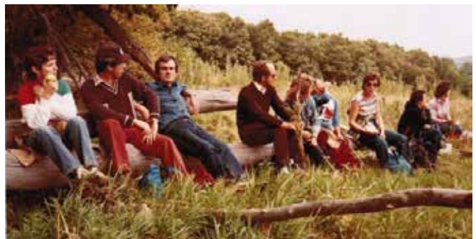
▲ Hikers resting during a hike in Beaver Valley, 1983.