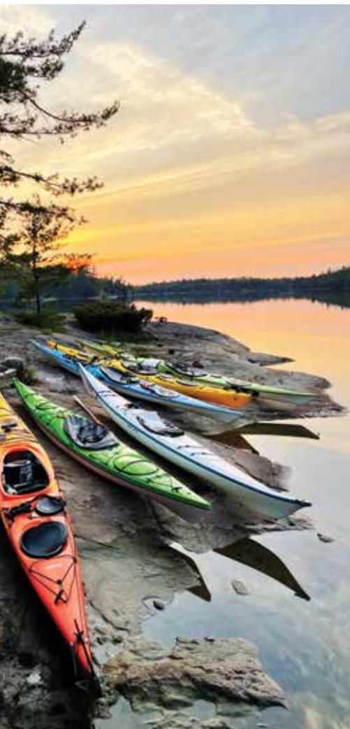
▲ End of day paddling in Massasauga Provincial Park, Georgian Bay.

mentoring experience, and to enjoy day and extended outdoor sport trips within Ontario, across Canada and overseas in a healthy, inclusive and safe social environment. This is captured by our tagline “Active and energized together outdoors”. Outdoor activities are offered at a variety of levels to accommodate a broad range of abilities and fitness.