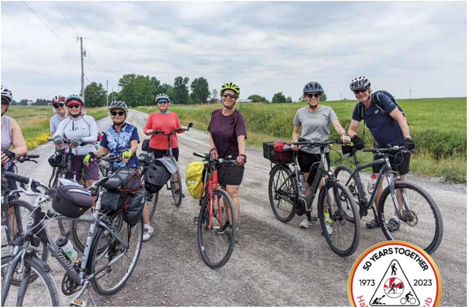
▲ Cycling Amherst Island on the Kingston Multisport Trip, 2023.