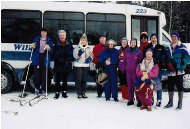
▲ Skiers on a bus trip in 1996.