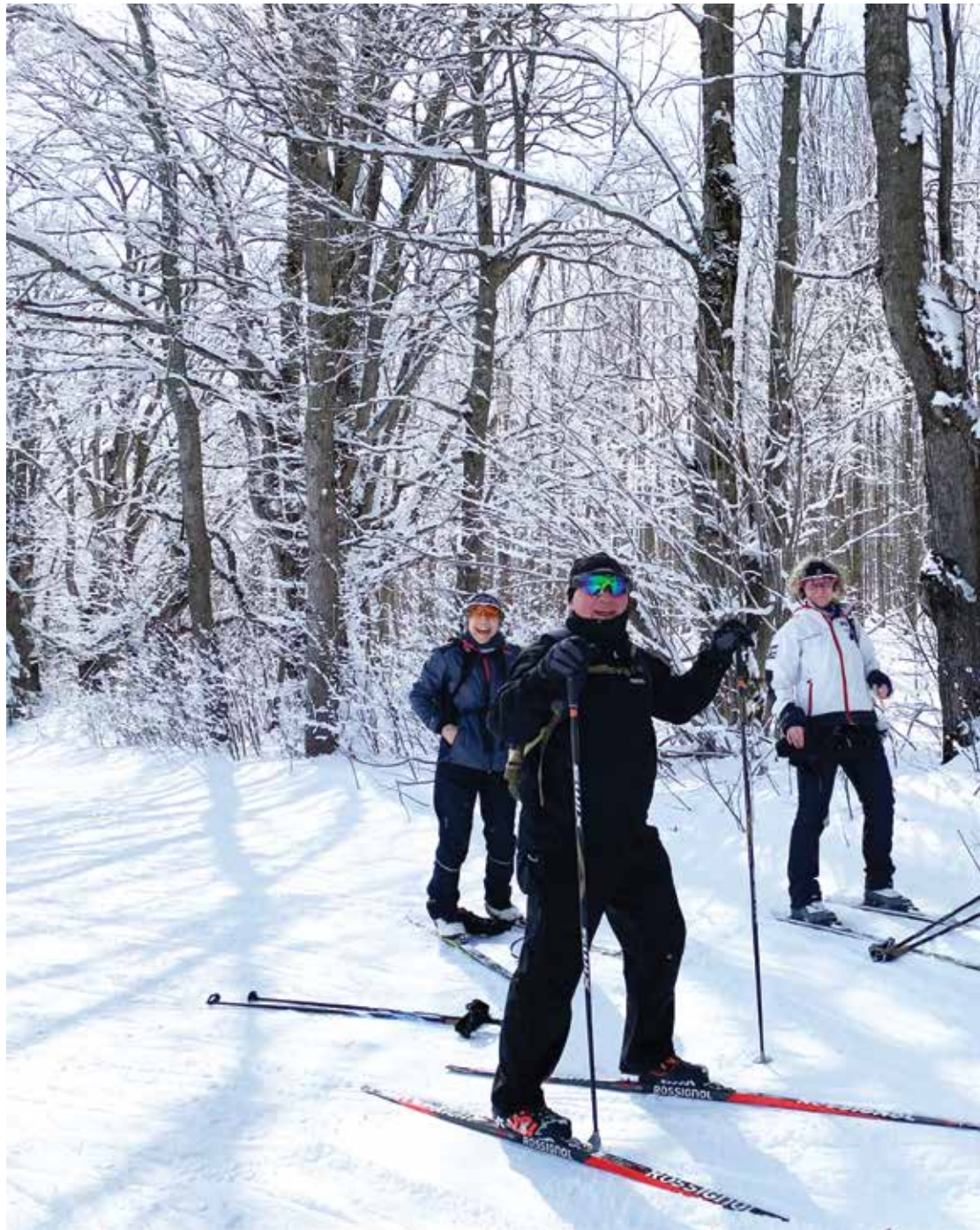
▲ Celebrating 50 years of club skiing, with Winterlude at Highlands Nordic, 2023.

Many early members had young families, and children's ski development programs were offered. The membership grew to a high of 1800.