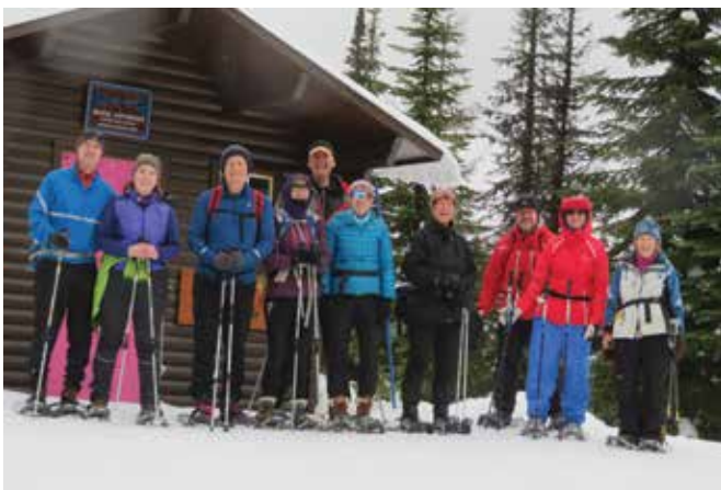
▲ Snowshoe hikers at Mountain View Cabin, Silver Star, B.C.