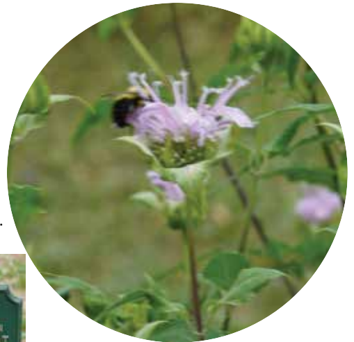
▶ Bee Balm demonstrating the reason for its name.