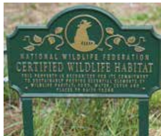
◀ A sign in the Beaudettes' front yard.