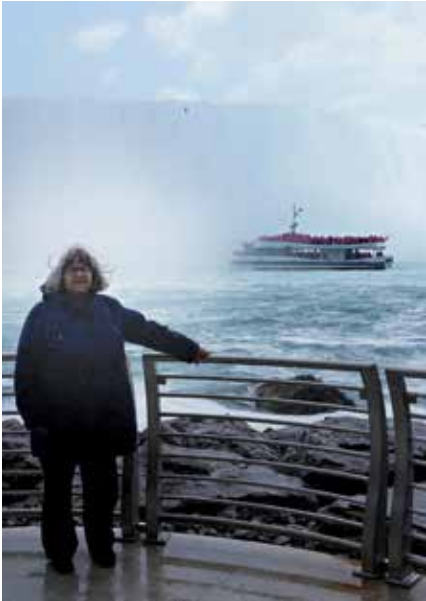
▲ At the Tunnel's new viewing platform with one of the sightseeing tour boats approaching the bottom of Horseshoe Falls.

Attending the opening of Niagara Parks' new attraction at Niagara Falls was a great pleasure. After the speeches and ribbon cutting, my co-publisher and I took an elevator down, seeing the antique inner workings of the power station as we descended. At the bottom we walked the new, safe passage surrounded by Edwardian brickwork that had been hand laid in the hand-dug water tunnel. It was astonishing to consider how much hard labour had gone into building this tunnel.