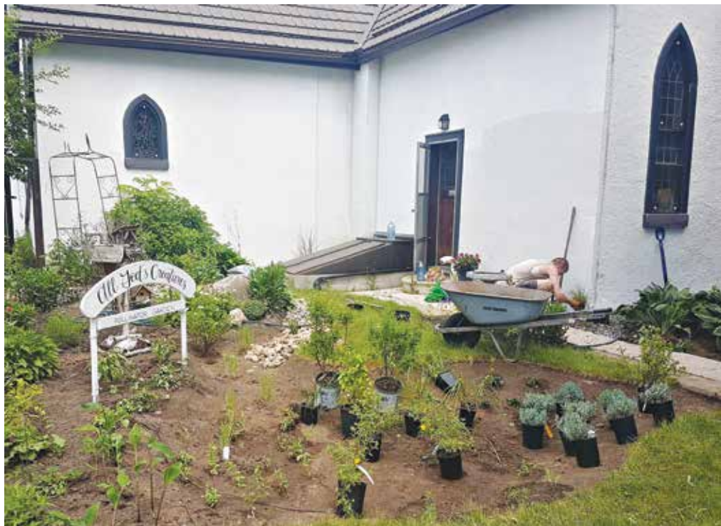
▲ Planting begins in the garden.