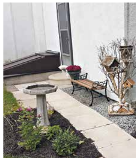
▲ A small bench welcomes visitors to sit near the birdbath and birdhouses.