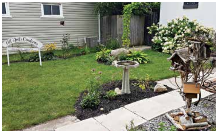
◀ A sign reads "All God's Creatures" near a vine-covered trellis.