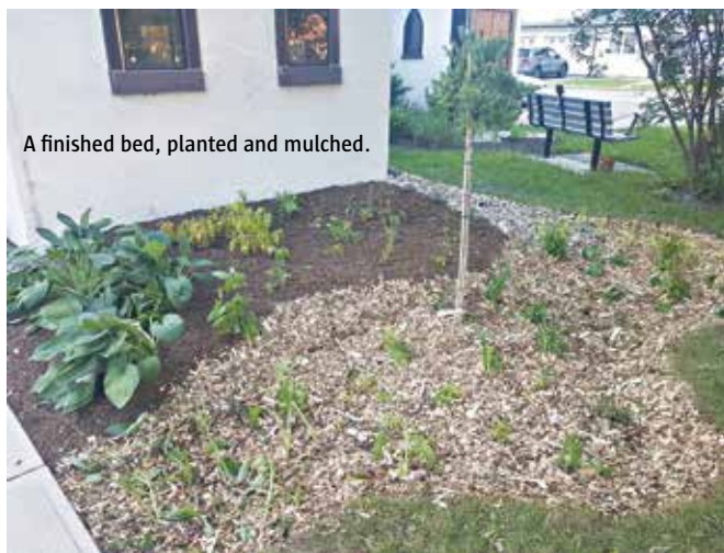
A finished bed, planted and mulched.