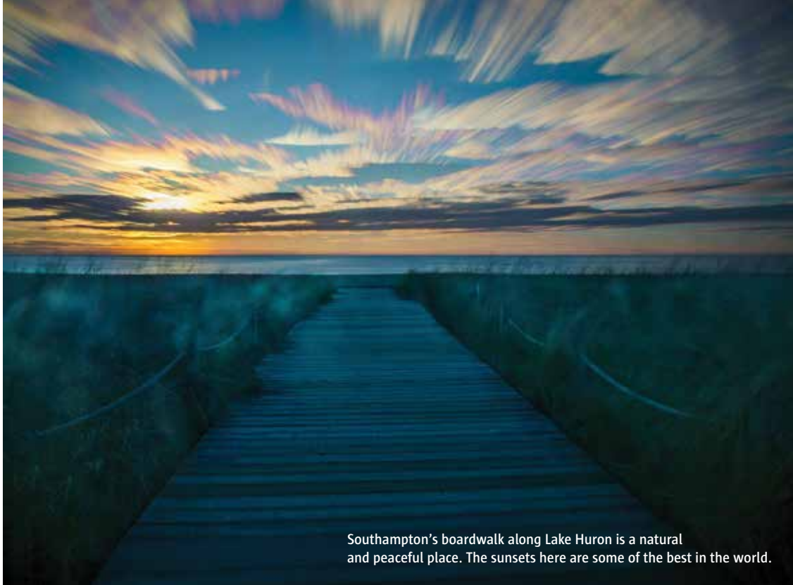
Southampton's boardwalk along Lake Huron is a natural and peaceful place. The sunsets here are some of the best in the world.