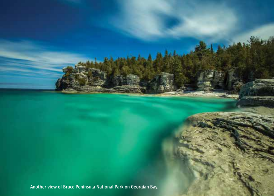
Another view of Bruce Peninsula National Park on Georgian Bay.