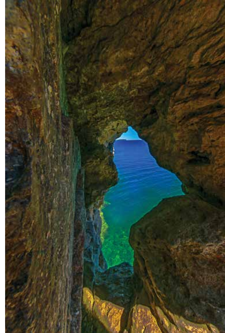
▲ A limestone cave at Bruce Peninsula National Park, overlooking Georgian's Bay clear water.

always try my best to capture that best shot of the day through the eye of the lens.