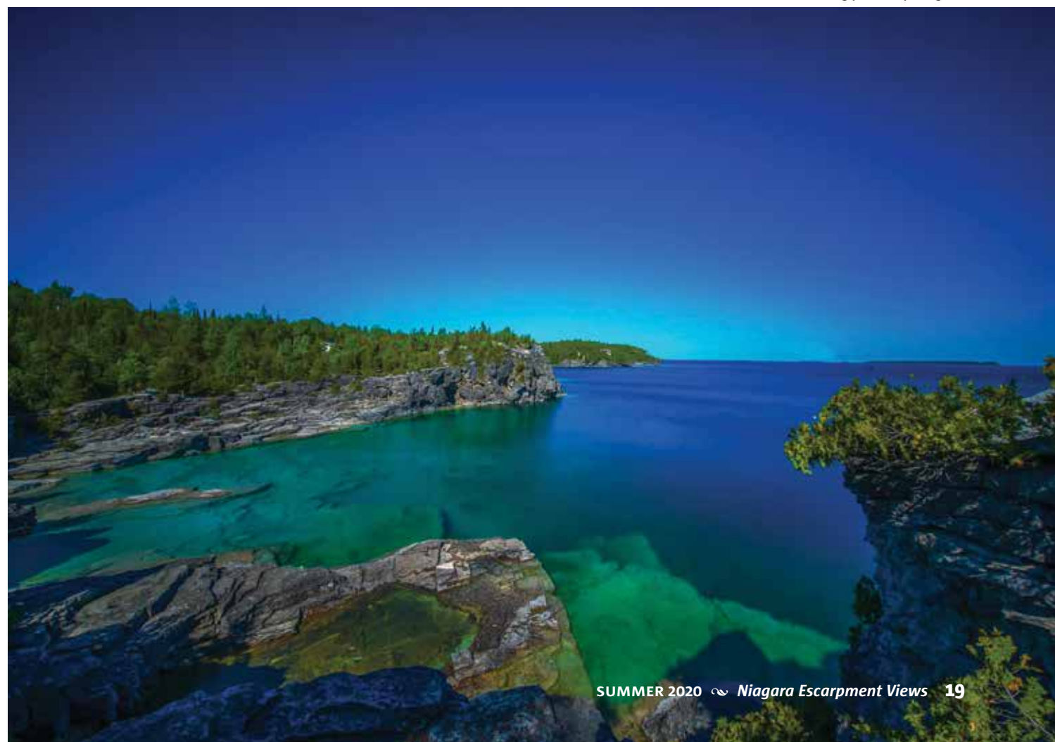
▼ Bruce Peninsula National Park offers breathtaking picturesque sights.