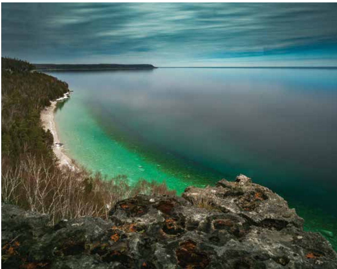
▲ Dyer's Bay, with its great hiking trails, is a photographer's paradise.

magazine, Postmedia Network and various galleries in Ontario. I've been involved in photography for over 27