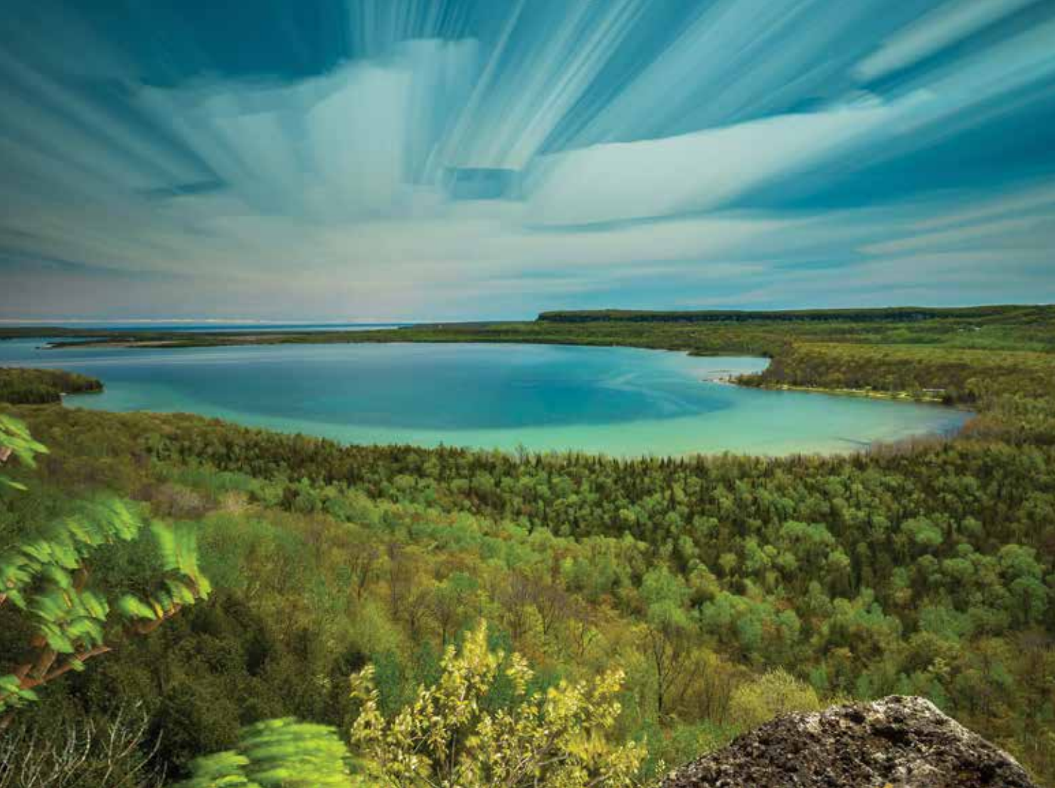
▲ Cape Croker on the eastern shore of the Bruce Peninsula belongs to the Chippewas of Nawash Unceded First Nation.