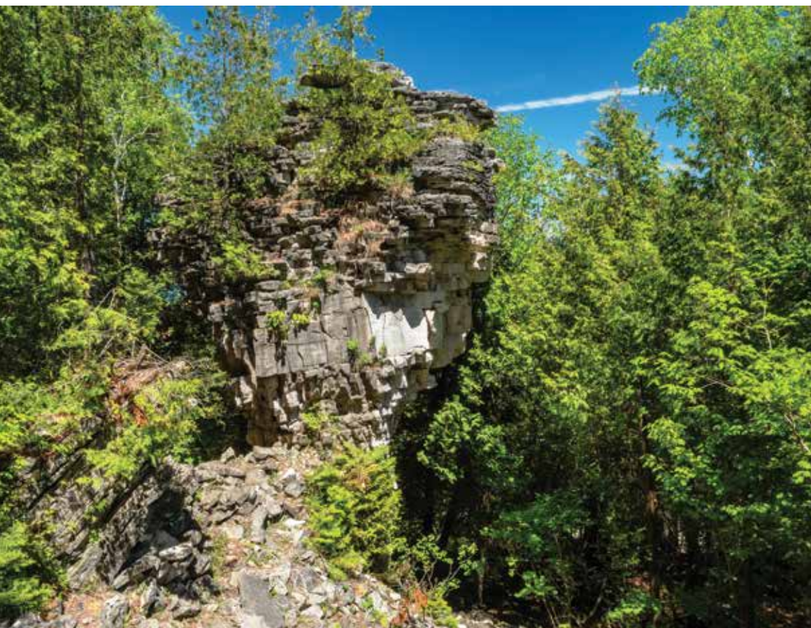
▲ Devil's Monument at Dyer's Bay is the largest flowerpot formation on the Bruce.