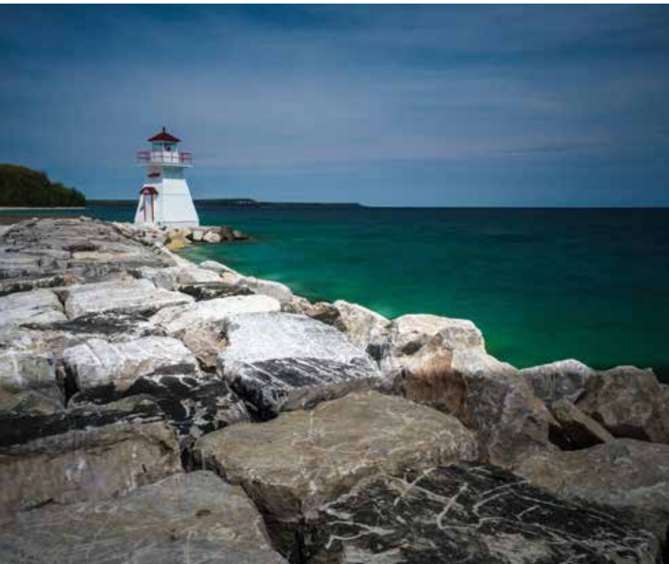
▲ This lighthouse at Lion's Head was ruined by a storm in January.