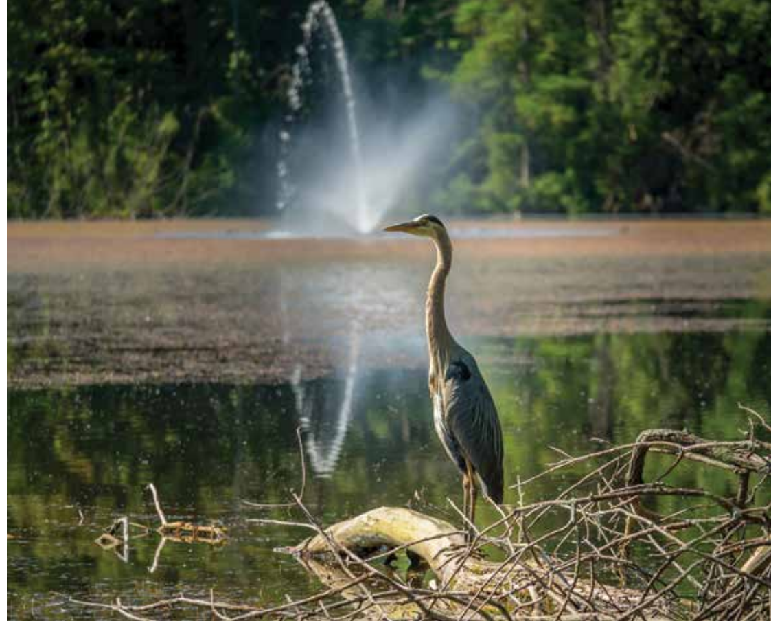
▲ This beautiful Great Blue Heron was at Fairy Lake in Southampton. The lake is close to downtown and has a pleasant trail around it.