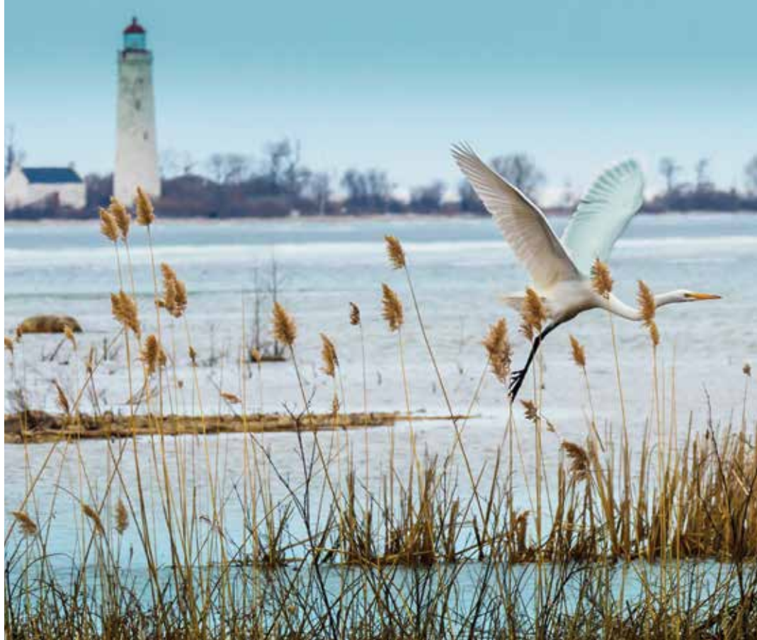
▲ While walking the boardwalk in Southampton last summer, I saw a beautiful Egret flying right across my path. Chantry Island is in the distance.