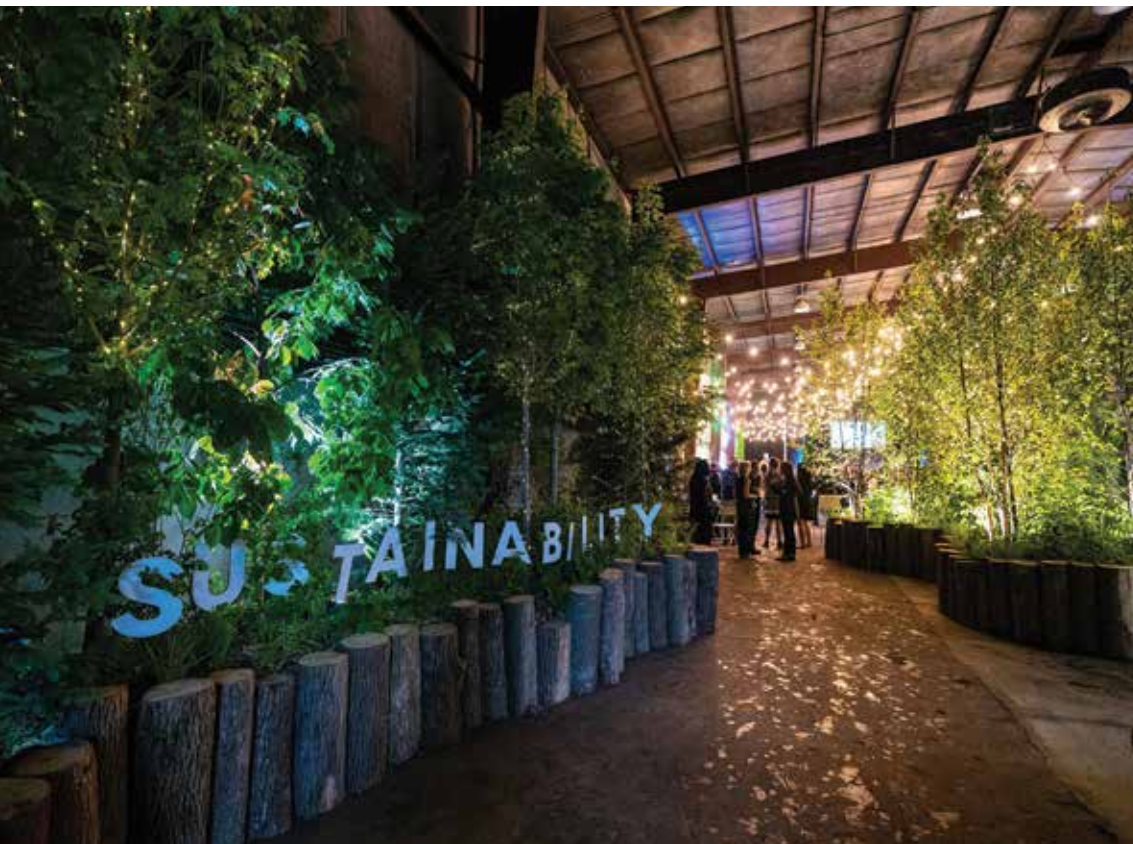
▲ Conservation Halton hosted the Friluftsliv Foundation Gala on June 20 at Kelso Quarry Park. An indoor forest was created to be a visual representation of climate mitigation and adaptation, and the trees were auctioned to raise funds for tree planting. The goal was for each of the 1,153 trees and shrubs to be funded and this goal was easily surpassed. Each of the trees will be planted on Conservation Halton properties to restore forests affected by invasive species.