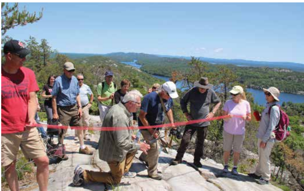
▲ On June 22 members of Escarpment Biosphere Conservancy, Bay of Islands Community Association, MacGregor Bay Association, Willisville and Vale celebrated the successful purchase of Willisville Mountain north of Manitoulin Island, ensuring its protection as a natural area. The public is welcome to use the existing walking trail to the summit. More trails and parking spots are planned.