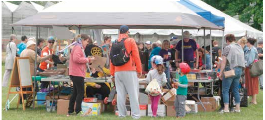
► Rotary Club of Hamilton AM hosted the 9th Annual Imagine in the Park children's arts festival in Gage Park, Hamilton on June 1. Over 4500 children and adults attended and every child left with a free book.