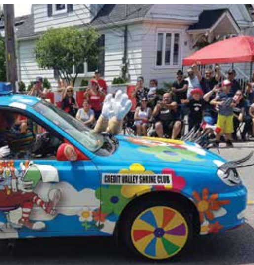
▲ Half a car stole the spotlight in the Glen Williams' Canada Day parade, July 1.