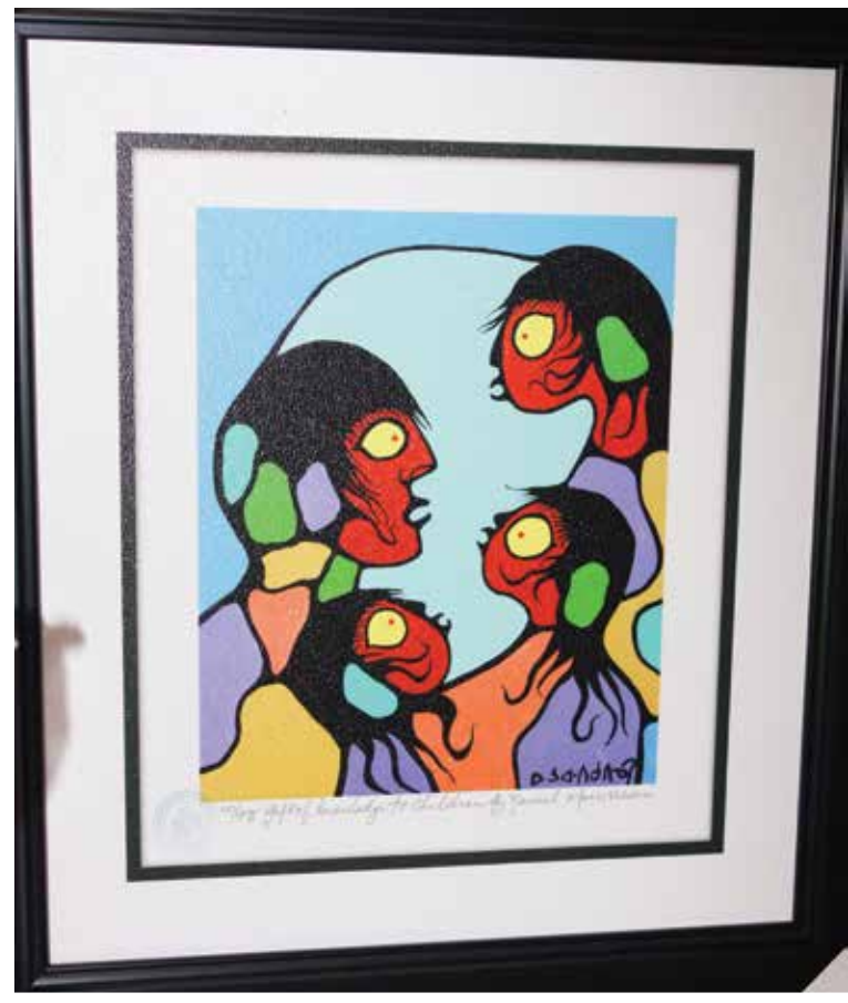
▼ This work available at Milton's The Gallery Upstairs is authenticated as "20/975 Gift of Knowledge to Children by Norval Morrisseau."