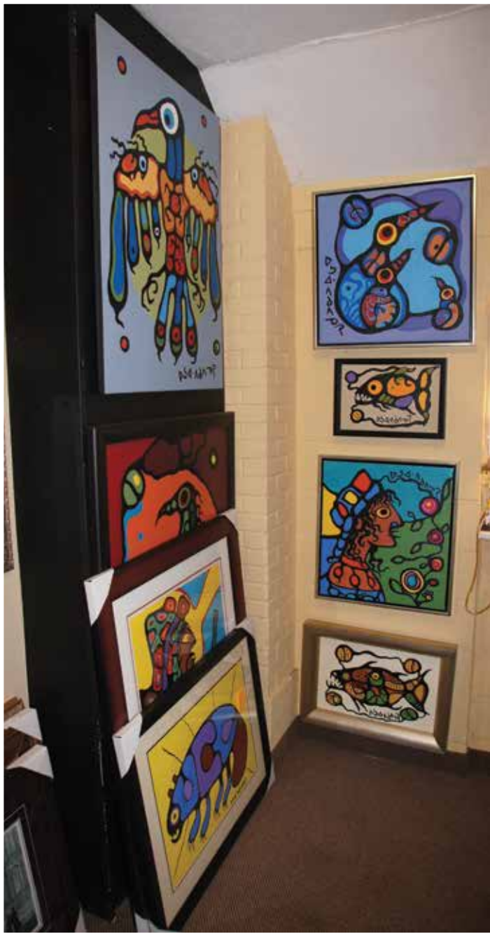
▲ The Gallery Upstairs, in Milton, offers a selection of Norval Morrisseau originals, prints and serigraphs. For more, see thegalleryupstairs.com .