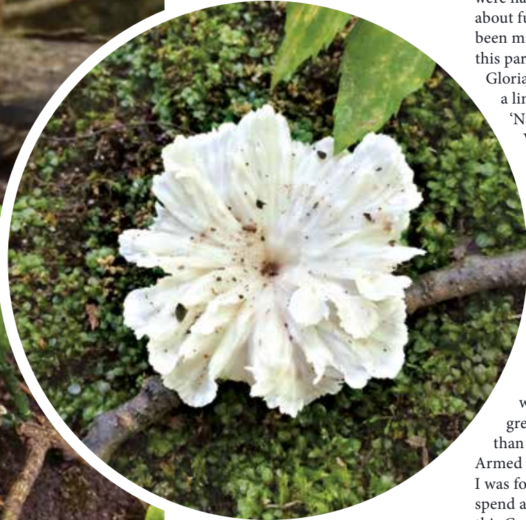
◀ "P.S. I'm including a couple of pictures I took last fall - a mushroom that made me laugh and another that I thought was beautiful! Enjoy."