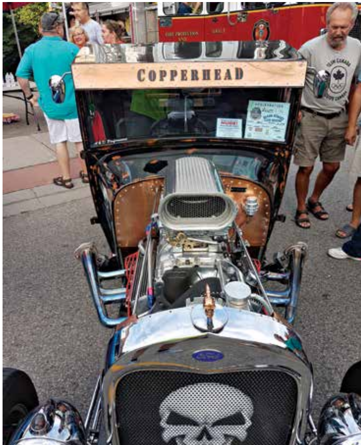
▲ Downtown Georgetown's 19th annual Rock'n'Roll Classics was held on Aug. 24. This 1930s hot rod was one of hundreds of vehicles on display.