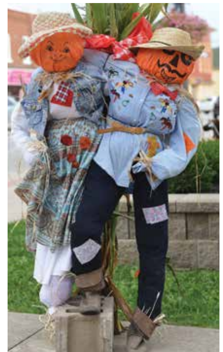
▲ The 22nd annual Meaford Scarecrow Invasion and Family Festival began on Sept. 4. More than 250 creations with the theme “Scarecrows Go Western” were placed in downtown Meaford where they remained until after Thanksgiving. A Scarecrow Hoedown was held Sept. 27 and a parade took place on Sept. 28. PHOTO SUBMITTED.