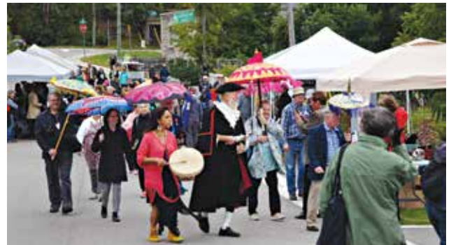
▲ Festival Sunday of the 30th annual Eden Mills Writers Festival opened on Sept. 9 with its traditional parade with bagpipes, a Town Crier and colourful umbrellas from Bali.