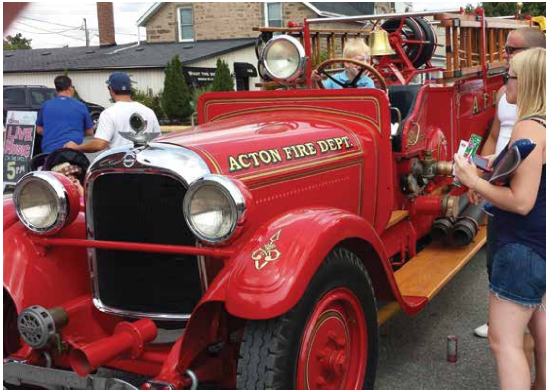
► A vintage fire truck was available for exploration at the Aug. 12 street party, Acton Leathertown Festival.