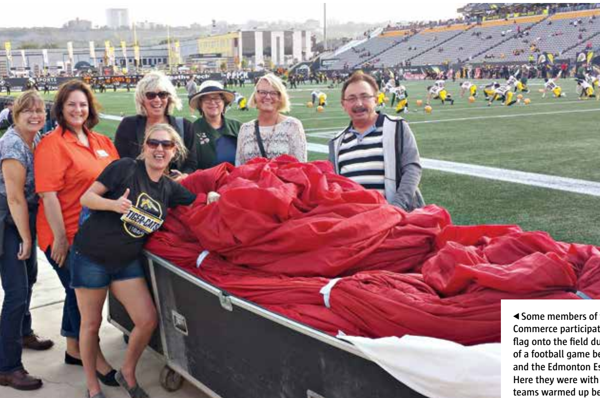
◀ Some members of the Halton Hills Chamber of Commerce participated in carrying a huge Canadian flag onto the field during the opening ceremonies of a football game between the Hamilton Tiger Cats and the Edmonton Eskimos in Hamilton on Aug. 23. Here they were with the rolled-up flag while the teams warmed up before the game.