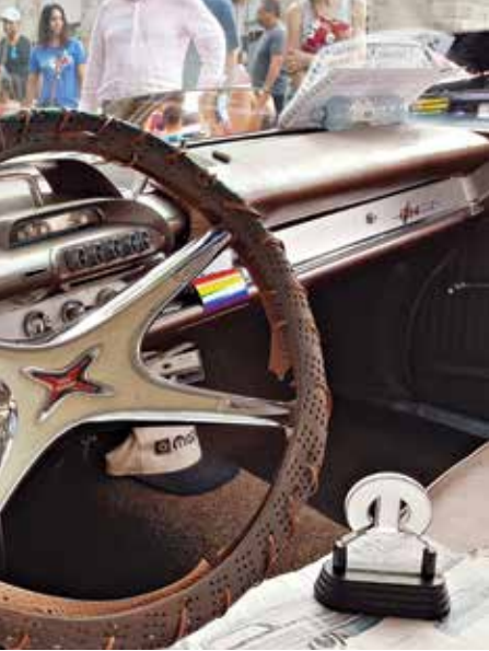
▲ Dashboard of a 1960s Dodge displayed at Downtown Milton Classic Car Show on July 20.