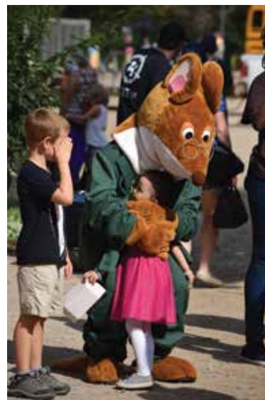
◀ Nearly 6,000 people attended the 10th annual Telling Tales Festival, for young readers, on Sept. 16 at Westfield Heritage Village in Hamilton.