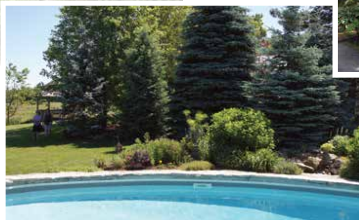
◀ Flowers, shrubs and mature trees frame the swimming pool at the back of Christine and Fred Webster's house. A gazebo beckons from the edge of the lawn.