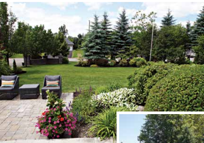
◀ Helen Reid's manicured front garden includes an inviting seating area.