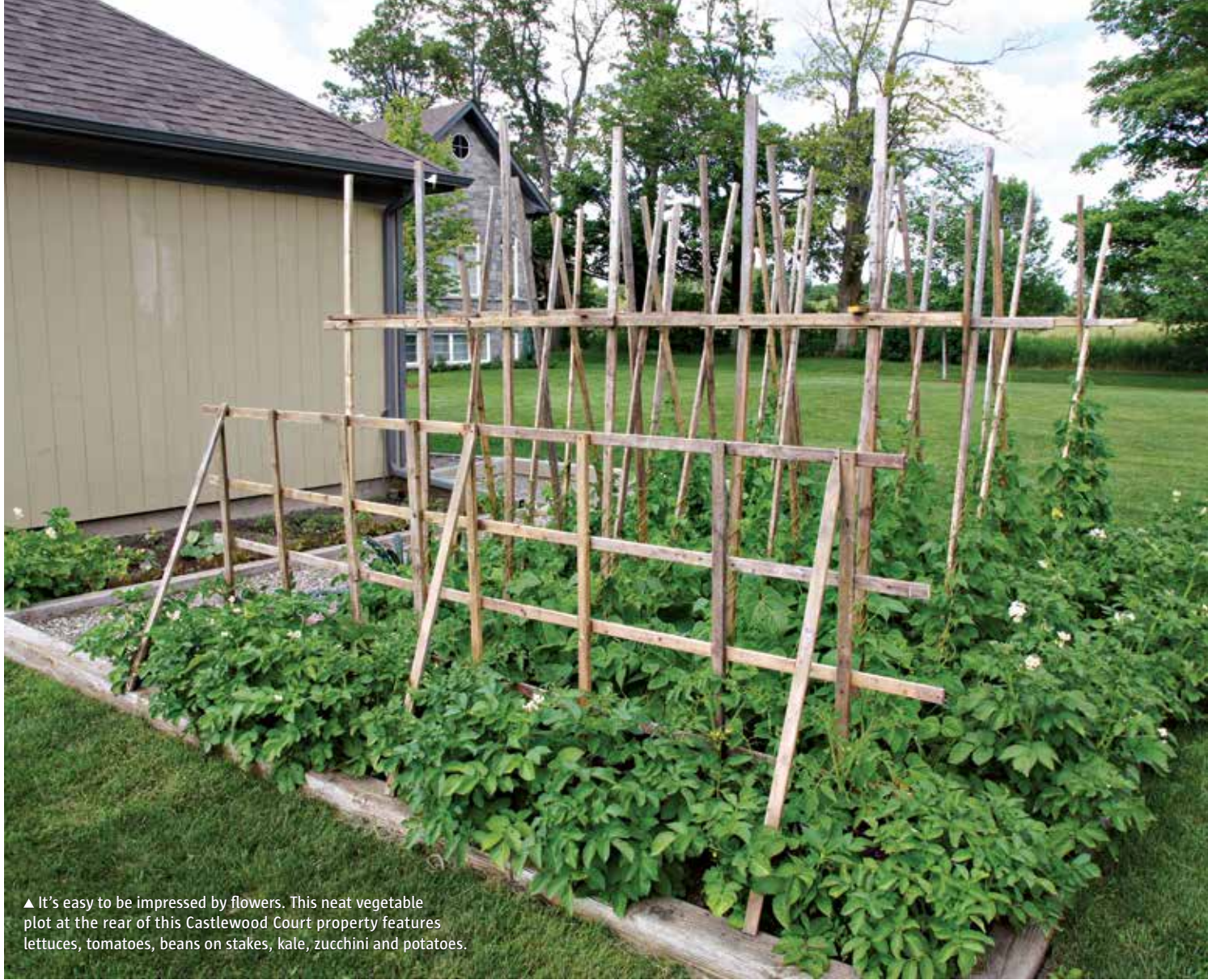
▲ It's easy to be impressed by flowers. This neat vegetable plot at the rear of this Castlewood Court property features lettuces, tomatoes, beans on stakes, kale, zucchini and potatoes.