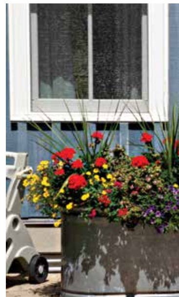
▲ Richly planted horse troughs brighten the terrace at the side of the large old farmhouse at Larchfield Farm.