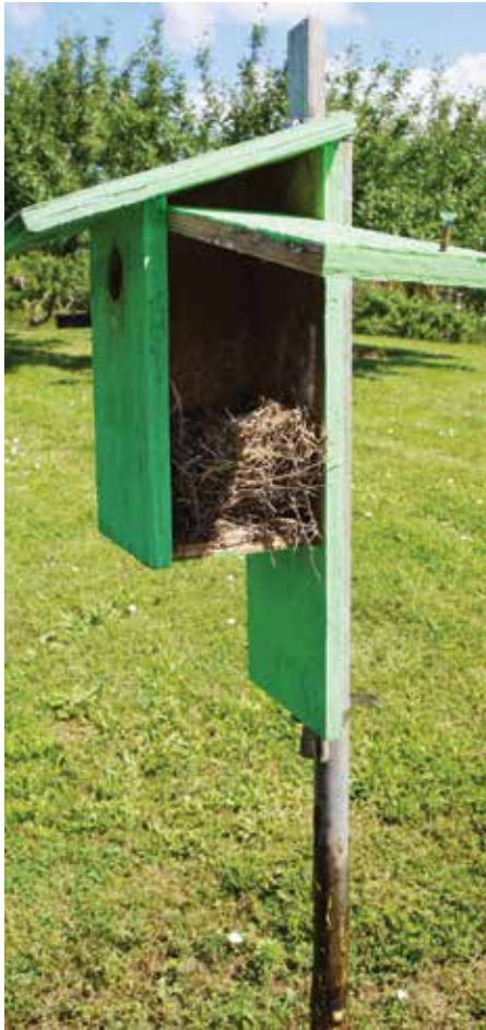
► A properly greased pole supports this approved nest box which was successfully used by Eastern Bluebirds.