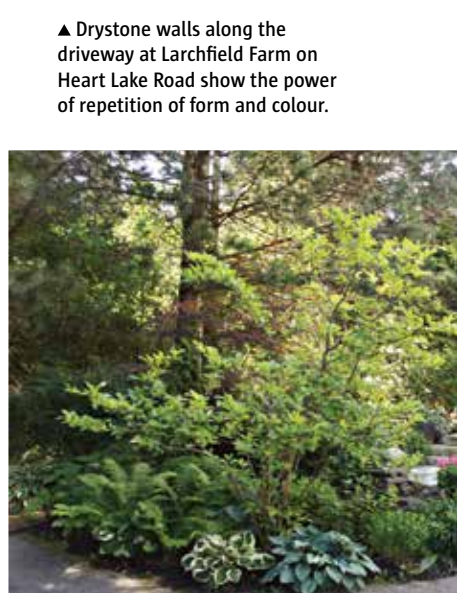
▲ Drystone walls along the driveway at Larchfield Farm on Heart Lake Road show the power of repetition of form and colour.