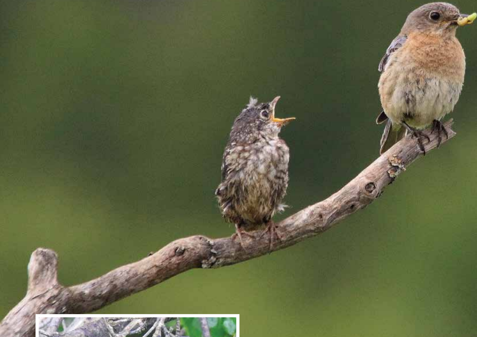
▲ Female Eastern Bluebird with her first-fledged chick of 2015.