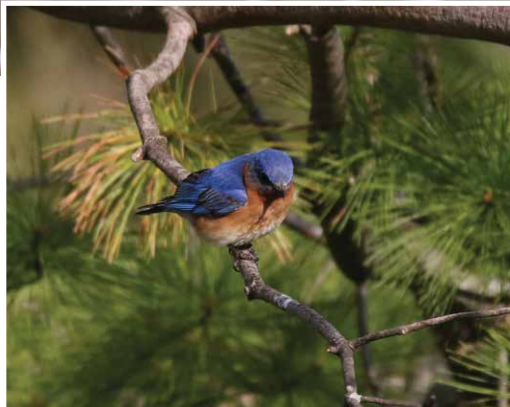
▲ Male Eastern Bluebird.