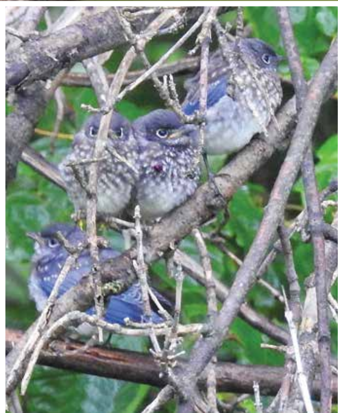
◀ Young fledglings in Burlington.