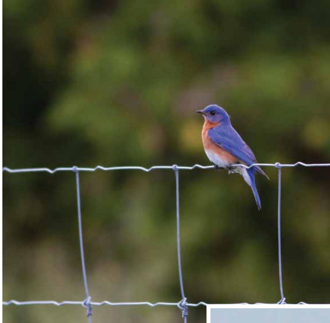
► Adult male Eastern Bluebird singing.

“After bluebirds fledge, parents feed them for about a week,” says Bill. “They like low grass where they can pick insects off the grass.” They can be fed mealworms from a feeder, especially when they’re nesting. Their main food in winter is Sumac trees.