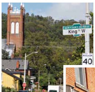
► Dundas is made for walking.