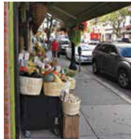
▲ Dundas is made for lounging.