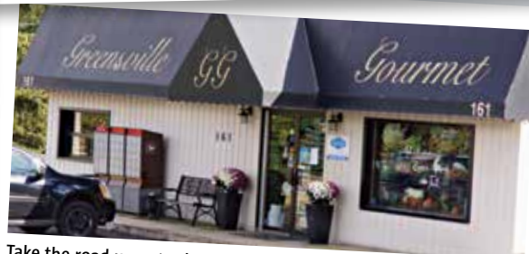
Take the road up onto the Niagara Escarpment, turn west and look for Greenville Gourmet, 161 Hwy 8, a specialty gourmet food and gift store.