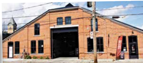
A block from King St. is Shawn & Ed Brewing Co., at 65 Hatt St. Free samples. Recommended: Lagershed Original, Black IPA.