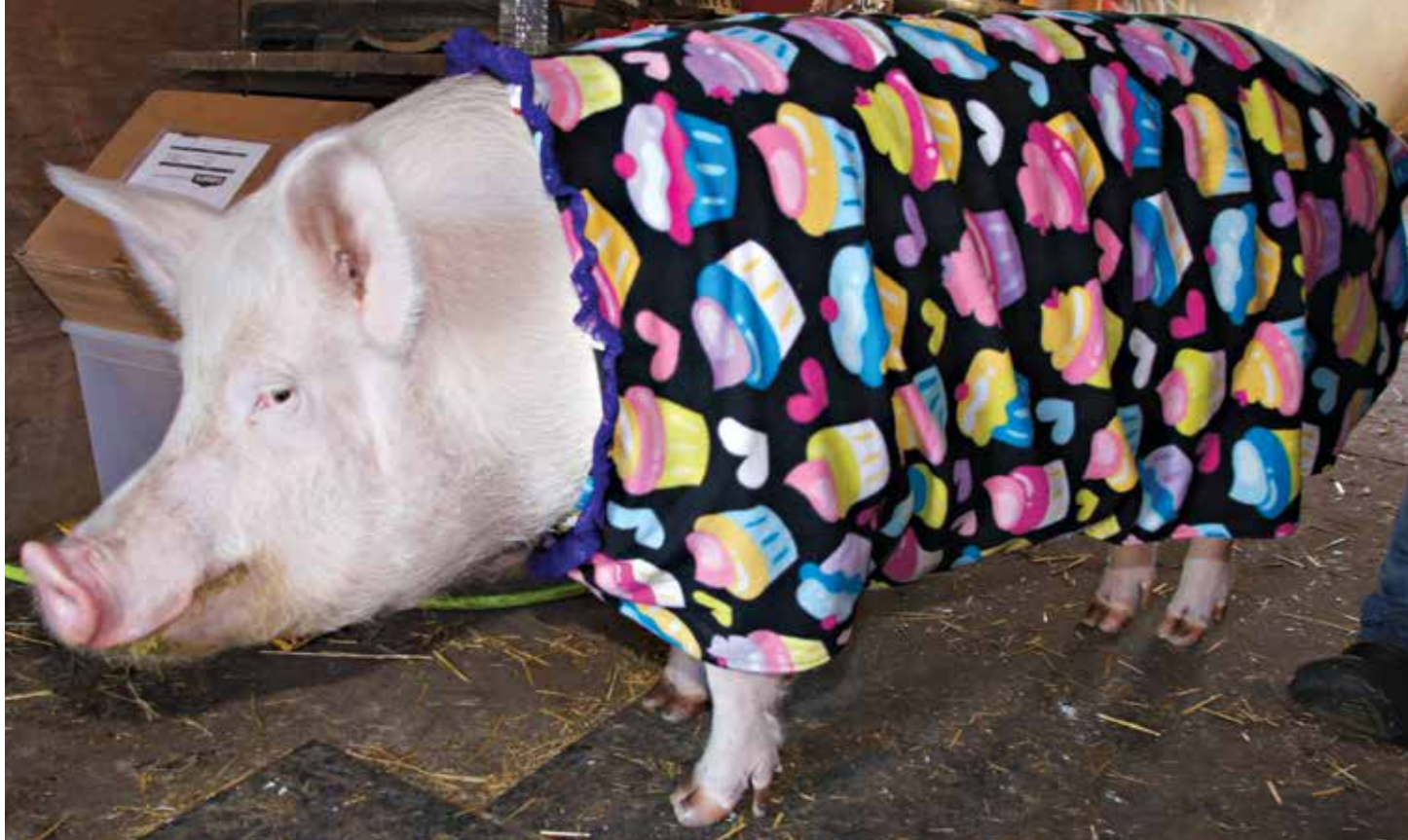
▲ Esther in the barn for her breakfast, wearing her cupcake cape, giving a wary eye to strangers.