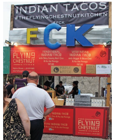
▲ The Flying Chestnut Kitchen of Eugenia Falls served up Indian tacos.