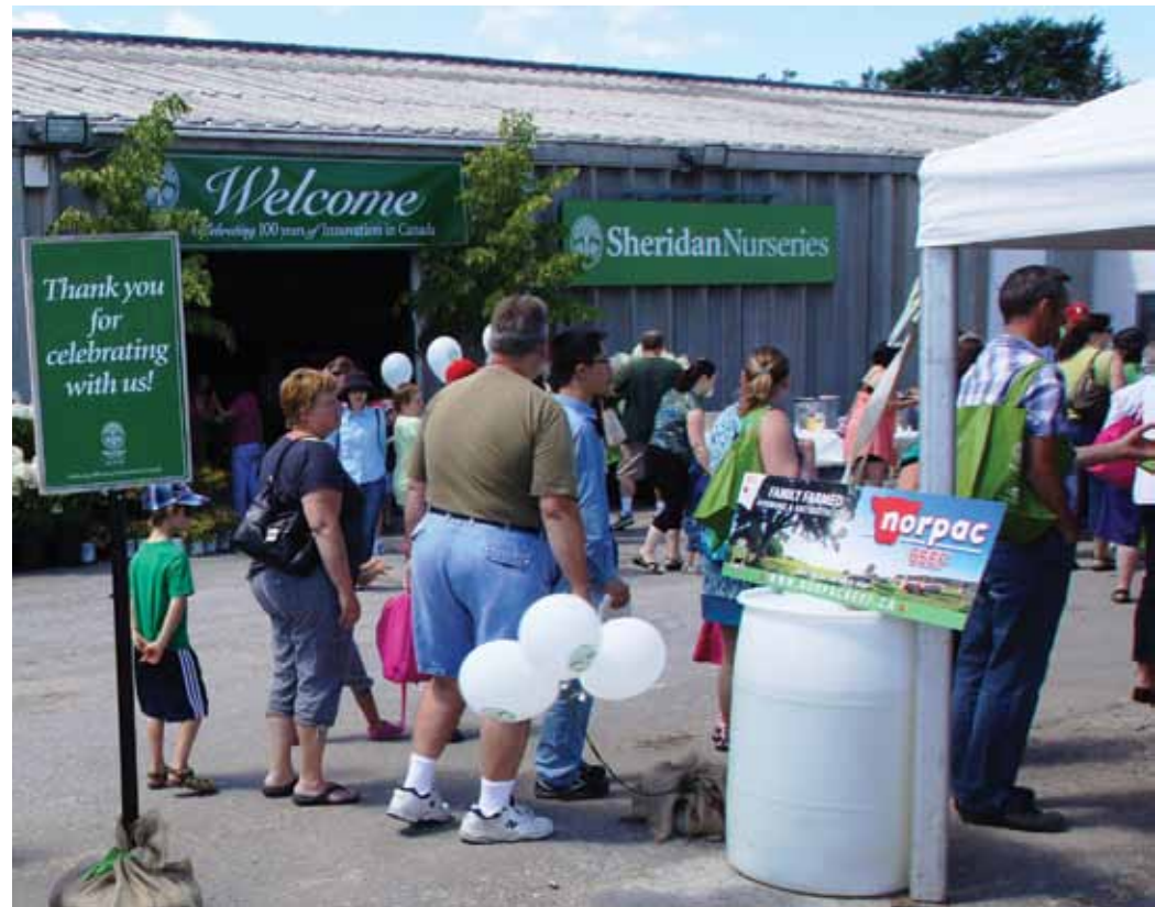
▲ Sheridan Nurseries held a free BBQ party on Aug. 10 at their Glen Williams' head office to celebrate their 100th anniversary. Hundreds of people attended.