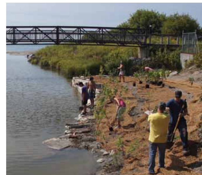
◀ On Aug. 27, volunteers with Manitoulin Streams Association planted a riverbank at Providence Bay with a variety of bushes including willow, dogwood, nannyberry and alder.