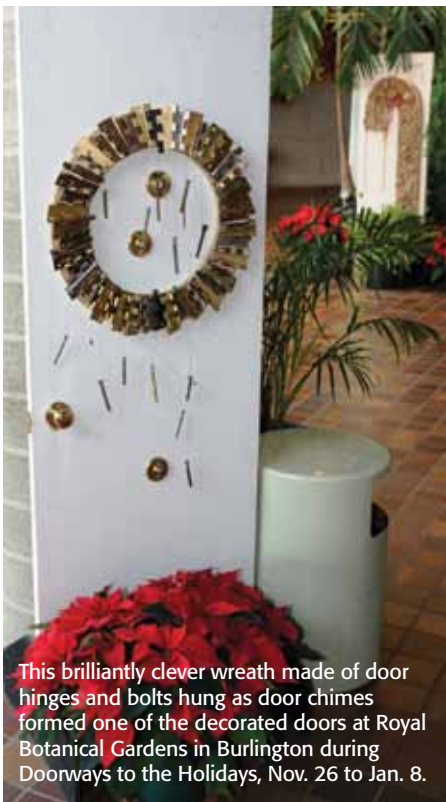
This brilliantly clever wreath made of door hinges and bolts hung as door chimes formed one of the decorated doors at Royal Botanical Gardens in Burlington during Doorways to the Holidays, Nov. 26 to Jan. 8.