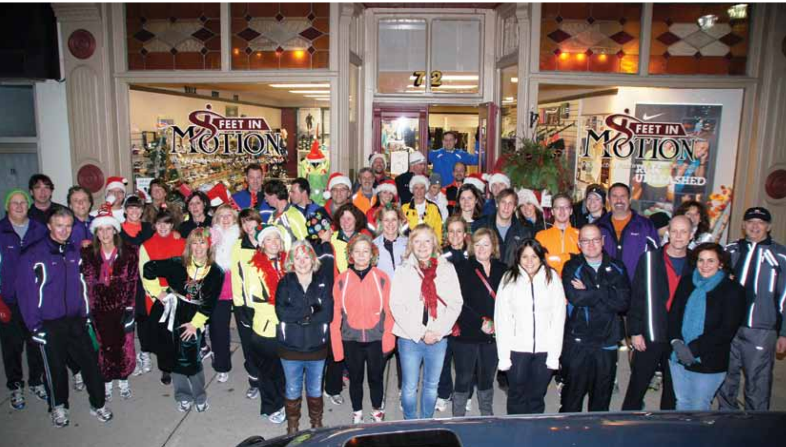
Runners, their spouses, partners and friends assembled at Feet in Motion, downtown Georgetown, on Dec. 3 for the annual Christmas Pub Run, which involves running or walking to a few local pubs and bars.