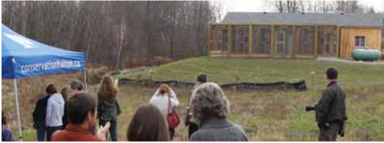
Conservation Halton celebrated the launch of the Mountsberg Shrike Recovery Project on Nov. 9. The Eastern Loggerhead Shrike is an endangered species of bird and a breeding facility for captive birds has been built to help increase numbers. Staff at Mountsberg hope to release hatchlings to the wild this year.