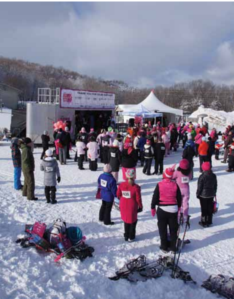
Escarpment Views was a media sponsor at Tubbs' Romp to Stomp [Out Breast Cancer], a fundraising snowshoe race event that was held Jan. 21 at Scenic Caves Nordic Centre, Collingwood, at the base of the snow-dusted Niagara Escarpment.

Please see www.EscarpmentViews.ca for more photos & listings!