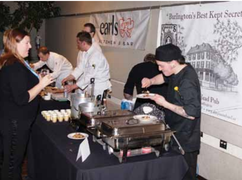
A Taste of Burlington, running Feb. 20 to March 11, was offered at Royal Botanical Gardens on Jan. 16. Several Burlington restaurants are offering a three-course menu at a special price.