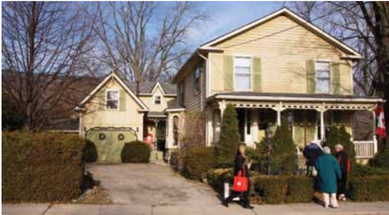
With the Niagara Escarpment in the background, this charming house on Hatt Street in Dundas was part of the Holiday House Tour on Dec. 3.