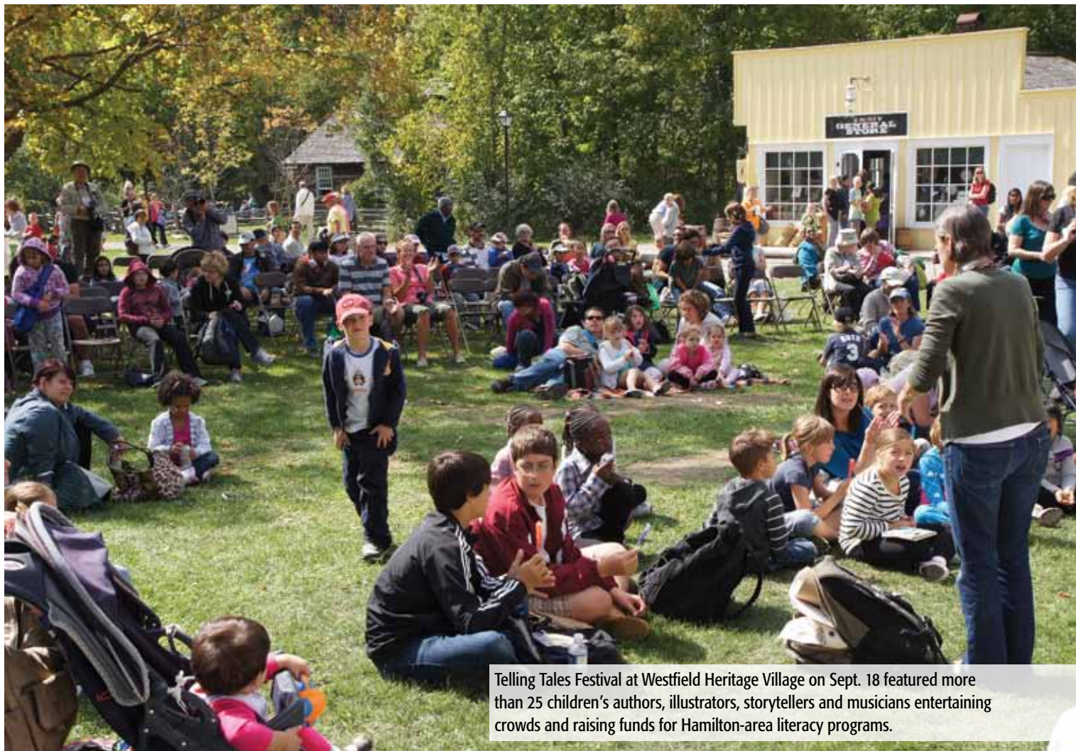
Telling Tales Festival at Westfield Heritage Village on Sept. 18 featured more than 25 children's authors, illustrators, storytellers and musicians entertaining crowds and raising funds for Hamilton-area literacy programs.