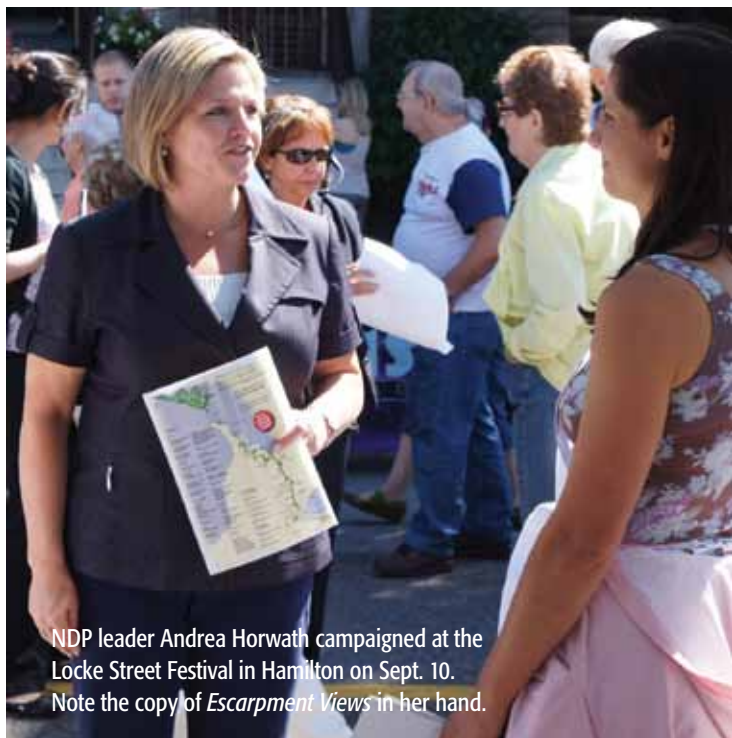
NDP leader Andrea Horwath campaigned at the Locke Street Festival in Hamilton on Sept. 10. Note the copy of Escarpment Views in her hand.