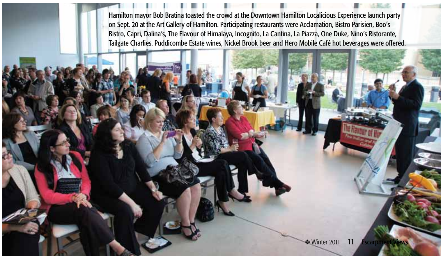
Hamilton mayor Bob Bratina toasted the crowd at the Downtown Hamilton Localicious Experience launch party on Sept. 20 at the Art Gallery of Hamilton. Participating restaurants were Acclamation, Bistro Parisien, Boo's Bistro, Capri, Dalina's, The Flavour of Himalaya, Incognito, La Cantina, La Piazza, One Duke, Nino's Ristorante, Tailgate Charlies. Puddicombe Estate wines, Nickel Brook beer and Hero Mobile Café hot beverages were offered.