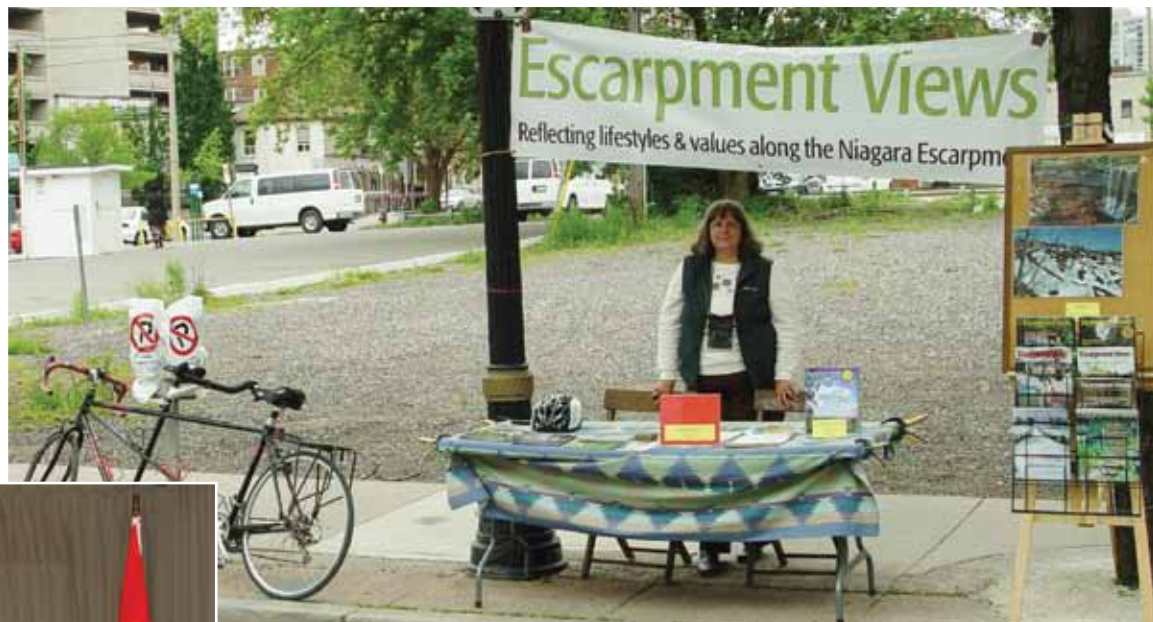
Escarpment Views took part in Open Streets Hamilton on June 12, giving free rides on a tandem bicycle as well as free back issues.