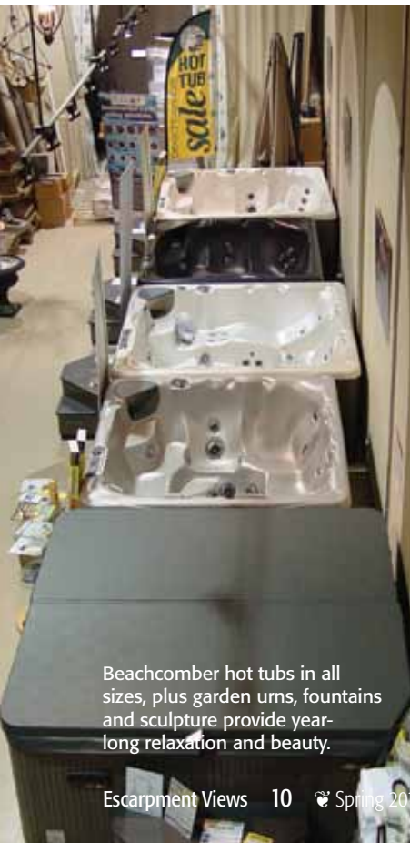
Beachcomber hot tubs in all sizes, plus garden urns, fountains and sculpture provide year-long relaxation and beauty.

Why it's worth the visit: "We carry unique products that you won't find at department stores. Our store is family-owned and operated, and our prices are low. People come back to us."