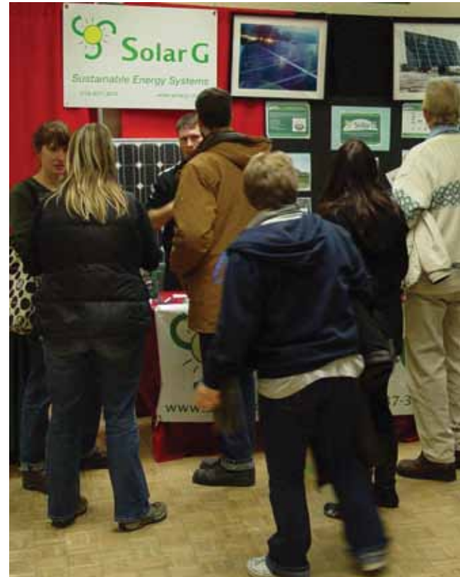
On Jan. 29 & 30, visitors to the Guelph Organic Conference Expo crowded round exhibitors like Solar G, a provider of solar and wind systems.