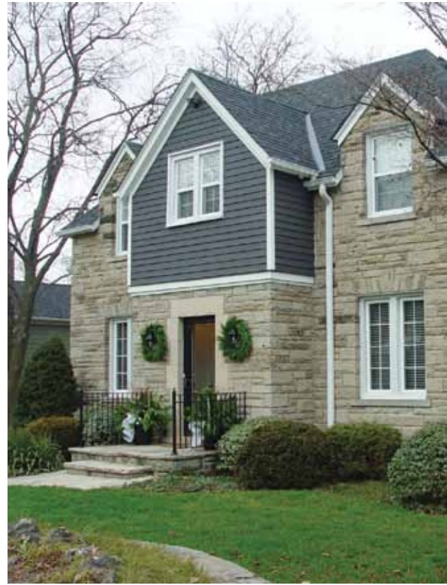
The annual house tour to benefit the United Way of Georgetown featured fine houses in the downtown area, on Nov. 19.