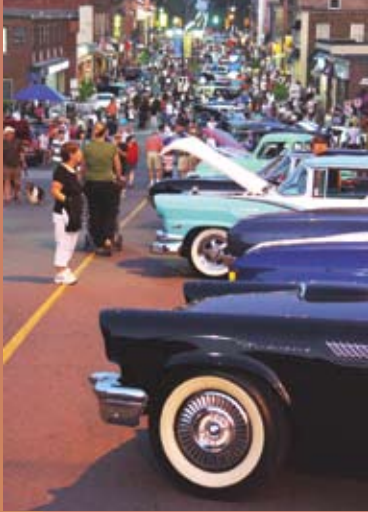
Rock'n Roll'n Classics filled downtown Georgetown's Main St. on Aug. 22 for a juried car show.

show where Escarpment Views has been in recent months. If you have an event you'd like us to feature next time, just send us an invitation!