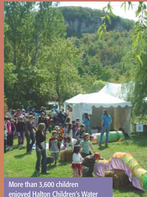
More than 3,600 children enjoyed Halton Children's Water Festival, Sept. 23-26 at Kelso Conservation Area, Milton, with the Escarpment as background.